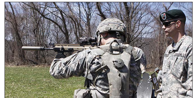
A cadet shoots an MK17 Mod at the historical weapons shoot April 18 at Range 5 with a member of the Massachusetts Special Forces National Guard standing by.

Interaction with the equipment and camp gear of the re-enactors was the objective while cadets waited to move onto the firing line. World War II re-enactors presented equipment and weapons to include a fully restored Willys jeep mounted with an M2 Browning .50 cal machine gun. Among these displays was a presentation by the Soldiers of the 20th Special Forces