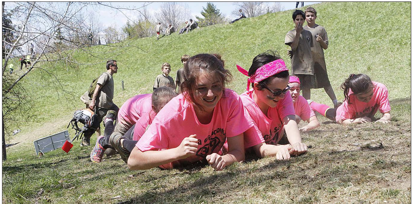
Girl Scout Troop 369 from Cumberland, Rhode Island, executes a low crawl task at the 53rd annual Scout Camporee at Lake Frederick May 2. Nearly 6,000 boy and girl scouts, including Venture Scouts, attended the two-day camp out.

Many scouts braved the frigid waters of Lake Frederick to